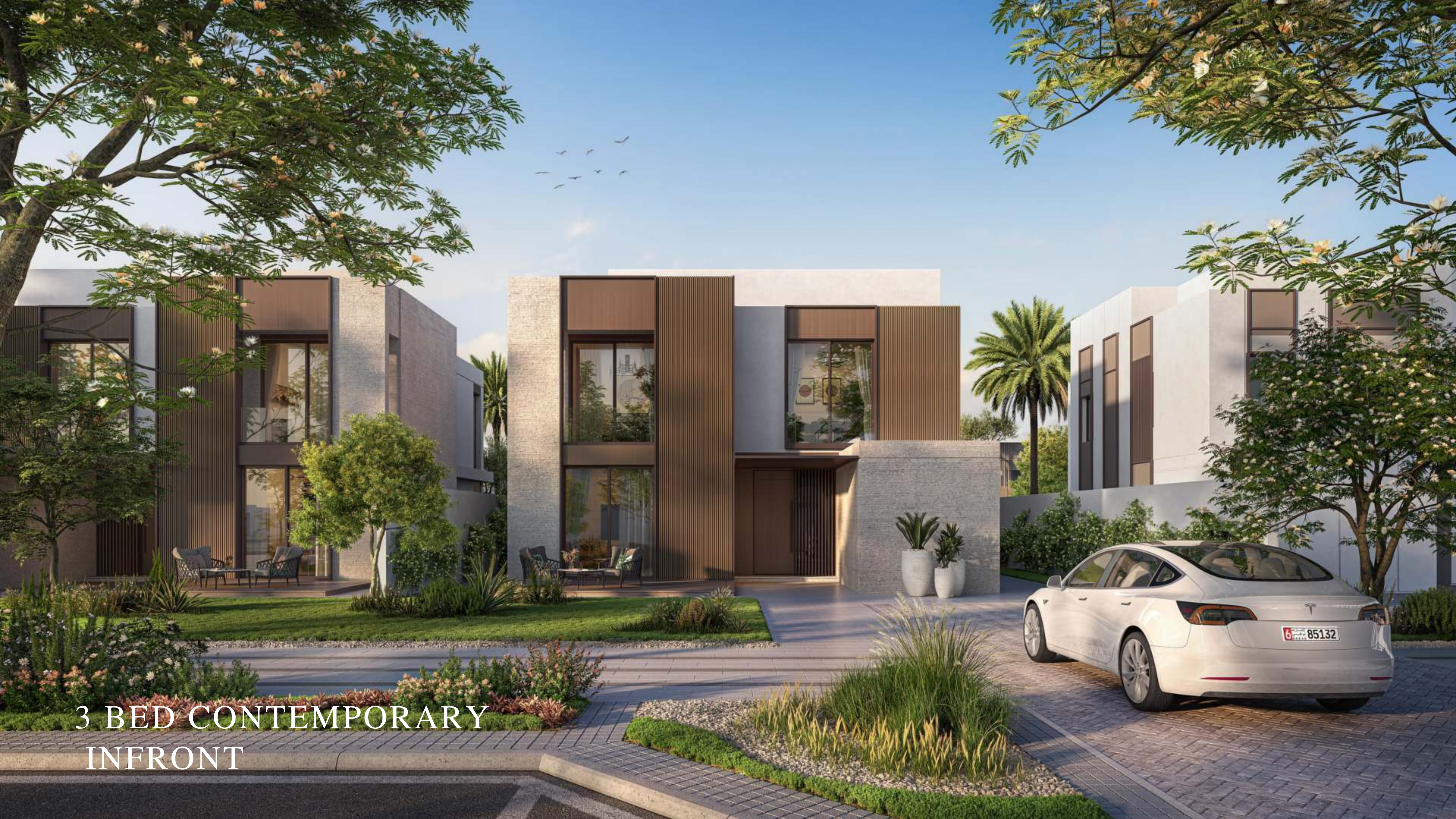
3 BED CONTEMPORARY INFRONT